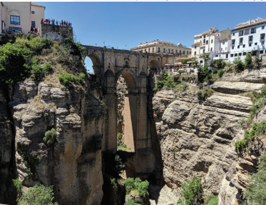
Ronda, Spain - Puente Nuevo, built in the late 1700's, was amazing to see in person.