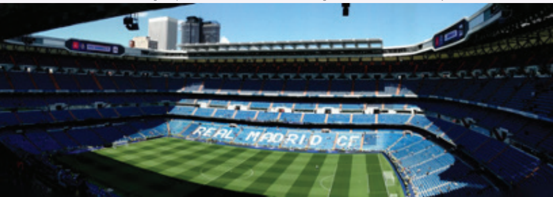
Madrid, Spain - Watching Real Madrid play soccer was certainly a highlight.