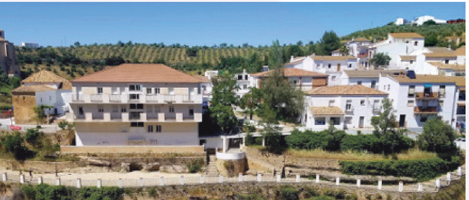
Setenil de las Bodegas, Spain - Whitewashed houses built right into the cliffs. It was very cool to walk around those streets. The pic almost looks photo-shopped.