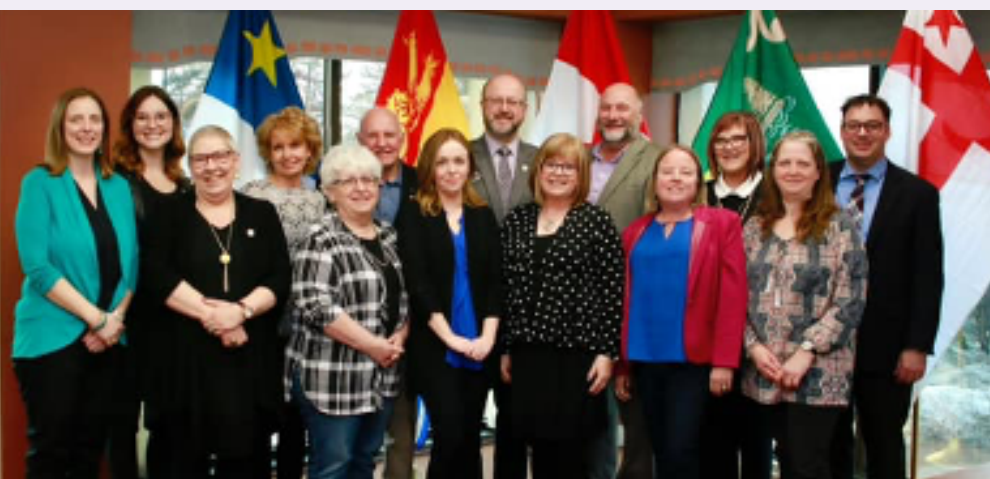
The Fergusson Foundation could not exist without the tremendous support of our volunteer Board of Directors.