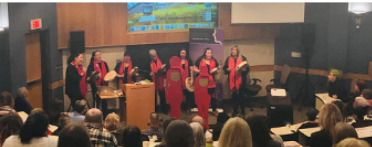
The Sisters of the Drum perform at the Fergusson Foundation's premier screening of our documentary "The Silent Witness Journey: Two Women's Stories"